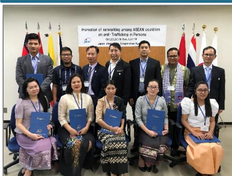
Participants from Vietnam, Thailand, Philippines, Cambodia, Laos and Myanmar.