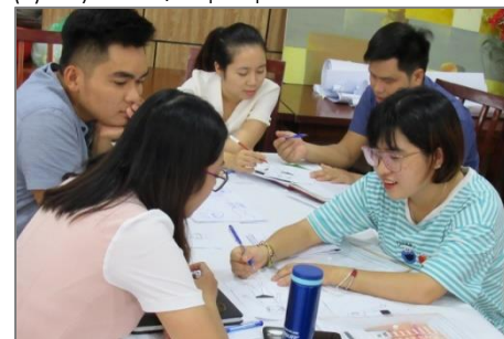
Various types of group work and role play had been done in the training session.