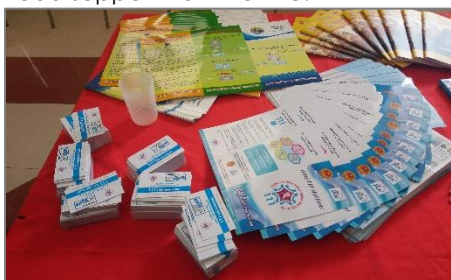
Various PR goods, such as leaflets and card visits have been developed and distributed

The Project focuses on PR activities in parallel with strengthening the capacity of the Anti-TIP hotline. Unless the hotline is known by potential victims or stakeholders, the counsellors cannot provide any services to the people who need support from hotline.